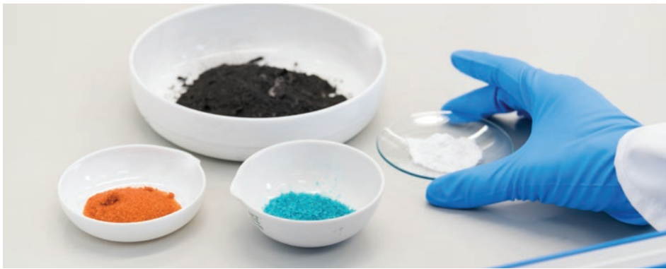
In addition to nickel (bottom center), Aurubis recovers cobalt (bottom left), lithium (bottom right), and graphite from black mass (top).

Black mass is the powdery content of used lithium-ion batteries that forms as a complex raw material when the batteries are recycled mechanically. Batteries are initially shredded and treated for this purpose. Black mass contains metals such as lithium, nickel, cobalt, and manganese, which can be recovered and subsequently used for new batteries or other products.